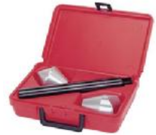
Ram Accessory Kit Part Number: 100004751800

Includes: 10" Ram extension, Conical head Claw attachment