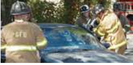
[ Hyattsville Volunteer Fire Department ]