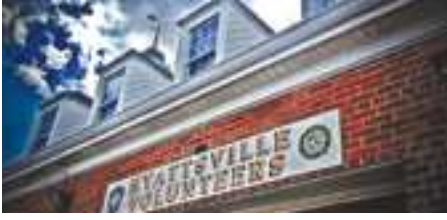
[ Hyattsville Volunteer Fire Department ]