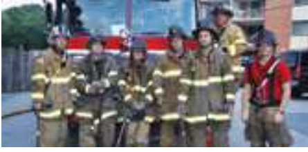
[ Hyattsville Volunteer Fire Department ]