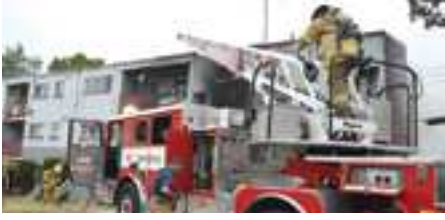
[ Hyattsville Volunteer Fire Department ]