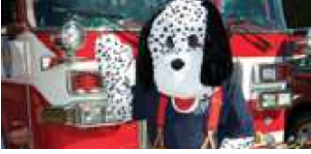
[ Hyattsville Volunteer Fire Department ]