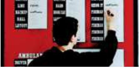
[ Hyattsville Volunteer Fire Department ]